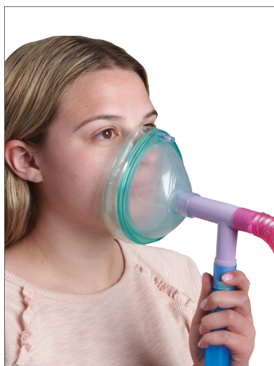
Disposable Breathing Circuit and Mask